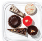
Premium Cake Flight

11" tray serves 8-12 14" tray serves 20-24