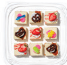
Crème Brûlée Cheesecake Sampler

Small tray serves 3-6 Medium tray serves 6-12