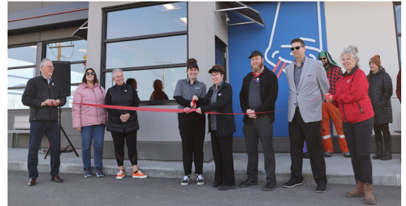
Outlook DQ Ribbon Cutting

However, 2023 was not without its bright spots. Our collaboration with Federated Co-operatives Limited (FCL) yielded increased patronage, bolstered by enhanced returns in food and significant growth in our petroleum sector. This year also marked an exciting expansion with the July inauguration of a Dairy Queen franchise in Outlook. This venture has not only been warmly welcomed by the community but also generated local employment, peaking at 40 positions during its opening. It stands as a testament to our commitment to diversifying and enriching our local economy.