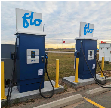
Davidson FLO Chargers

We were also at the forefront of sustainable energy initiatives, proudly launching two electric vehicle charging stations in Davidson and Outlook, supported by grants from SaskPower and Natural Resources Canada. This move aligns with our long-standing role as an energy provider and our vision to stay attuned to future trends.