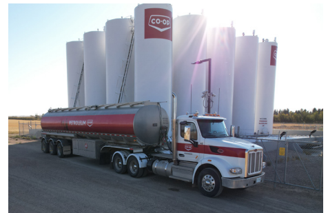
Outlook Bulk Fuel Plant, Spring 2023